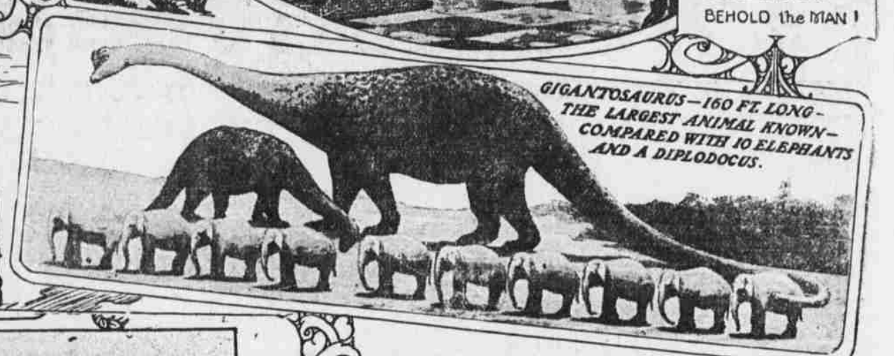
GIGANTOSAURUS—160 FT. LONG—THE LARGEST ANIMAL KNOWN—COMPARED WITH 10 ELEPHANTS AND A DIPLODOCUS.