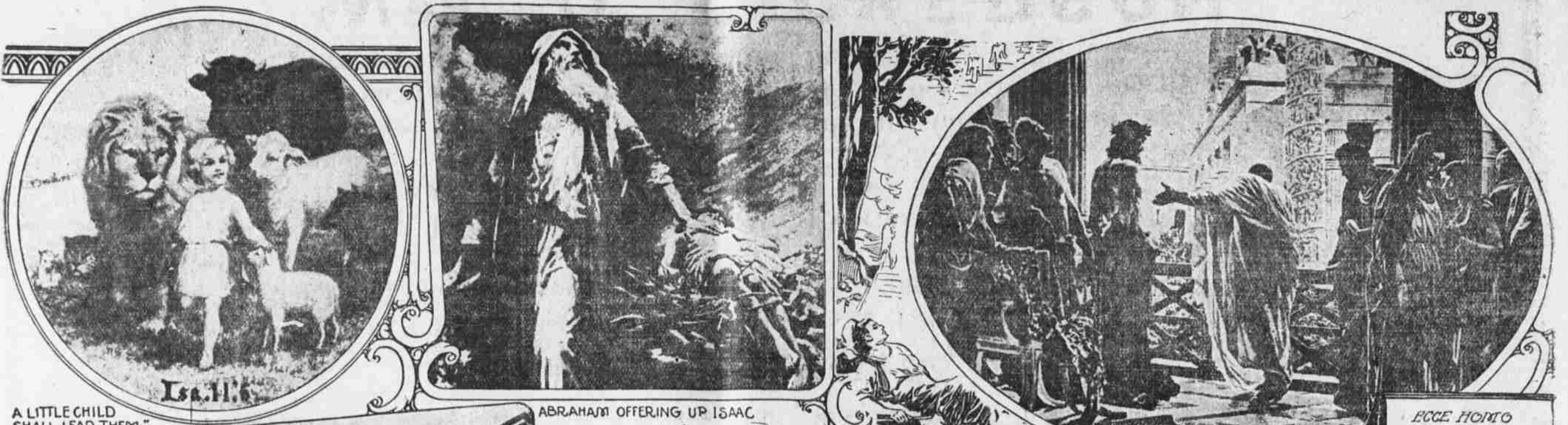
A LITTLE CHILD SHALL LEAD THEM