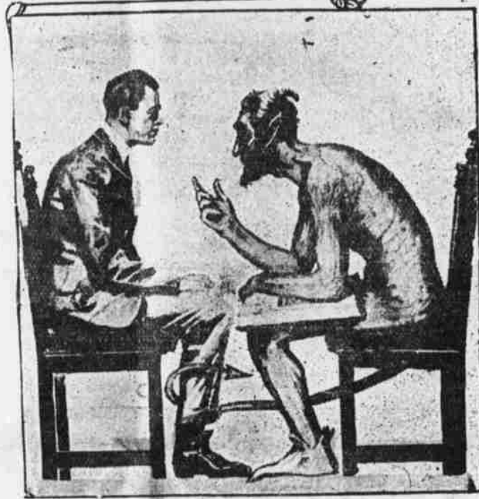
OUR COLLEGES TEACHING HIGHER CRITICISM