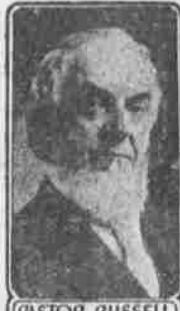
New Haven, Conn., Nov. 26.—Pastor Russell, of the Brooklyn and London Tabernacles, addressed large and interested audiences here twice today. We report his discourse on Thanksgiving. He said:—Our experiences in life are to a considerable extent what we make them. Bible students should be philosophers—every one of them. Why? Because the Wisdom from above is the noblest science and best instruction. As St. Paul declares, it tends to promote the spirit of a sound mind—and a sound mind is necessarily a philosophical one. Murmurers and complainers are not philosophers, but the reverse. A sound mind tells us to take things as they are, to make the best of them rather than to quarrel over them and find fault with Divine providence and make ourselves and everybody else in our environment miserable.

Pastor Russell in His Thanksgiving Sermon Says Unthankfulness Breeds Discontent and Undermines Happiness—True Christians Accept Their Life's Experiences Cheerfully, Knowing the Lord's Measure to Be Just.