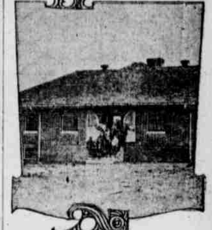
THE SCHOOL, DISTRICT 21, JEFFERSON COUNTY.

Four miles out of Louisville on one of the main turnpikes, where for years