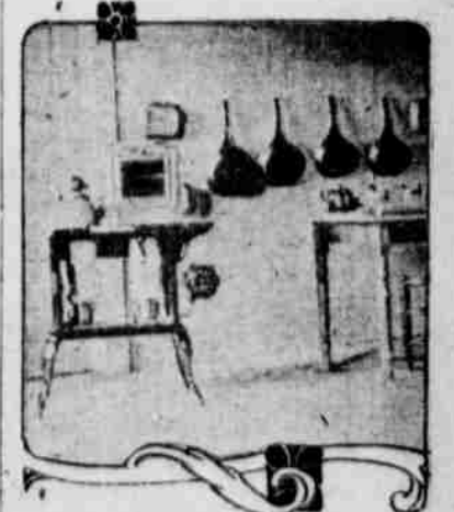
DOMESTIC SCIENCE ROOM.

The moment one enters the beautiful brick building with its soft green roof that harmonizes with the surroundings it is evident that it is an up to date school with a modern school equipment, for a sanitary drinking fountain is the first thing that catches the eye. The building has two beautiful schoolrooms perfectly lighted and equipped with modern sludge desks. Two ample cloakrooms are immediately in front of the classrooms and open into the main hall, while at one end of the building there is a cosy rest room for teachers and pupils, with a light, pleasant little library.