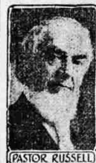
Cleveland, O., Oct. 10.—Pastor Russell preached here today a most instructive sermon from Galatians 6:7.

Mankind in General Live Largely in Gratification of Lower Organs of the Brain—Man Should Live Far Above Mere Animal Instincts—As Originally Created He Would Love and Seek God—Defilement of Sin—Blinded by Satan—God, Foreseeing All, Has Purposed Man's Deliverance—Happy Surprise Awaiting Awakened World.