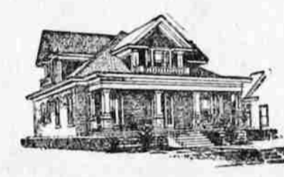
A No. 132-W IDEAL Boiler and 422 ft. of 38-in. AMERICAN Radiators, costing the owner $195, were used to heat this cottage in a liberal apartment building. This did not include costs of labor, pipe, valves, freight, etc., which are extra and vary according to climatic and other conditions.

Next to heating efficiency and fuel economy, the vital point in a boiler's construction is the method of joining the sections or waterways. IDEAL Boiler nipple connections are of metal, and their absolute tightness is not affected by expansion or contraction, fire, rust or corrosion—so far as we can tell after 17 years of test, they will remain perfectly tight for 50 years or more. Packed or gasket joints made up with rubber, asbestos, paper or composition washers are not used in IDEAL Boilers. There is nothing about IDEAL Boilers or AMERICAN Radiators to warp, loosen, rust or corrode.