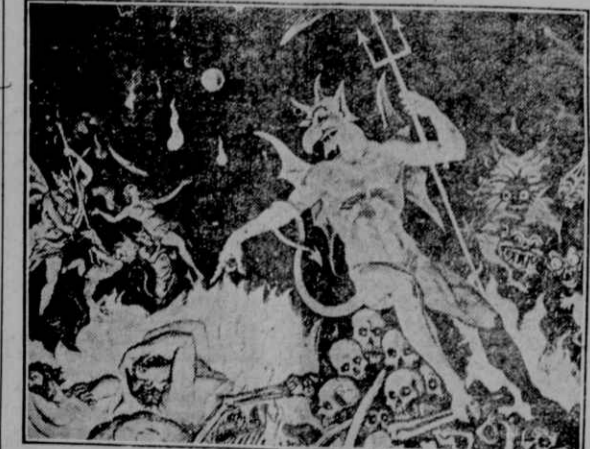
GOD'S "PLAN OF LOVE" AS ONCE MISUNDERSTOOD.

tivities extend to all the principal cities of the United States and Europe. The object of the association is, through various means, to encourage Bible study, and in the moving picture