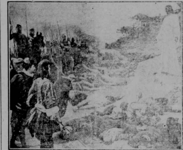
"DID YE THIS IN MY NAME?"

The Ordeals of the Martyrs. Some of the most graphic representations of the films have to do with the