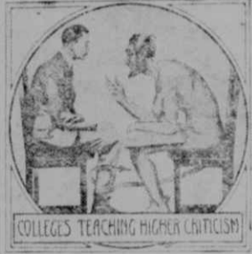
COLLEGES TEACHING HIGHER CRITICISM

Scenes Staged in Holy Land. The preparation of the films used in the exhibition has involved a considerable expense and activities conducted in all parts of the world. The cameras have been carried into the Holy Land, and there on the Mount of