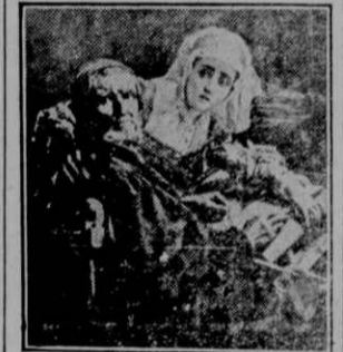
"READING BIBLE FORBIDDEN."

of God's Word is planning to place in many large cities the photo-drama, which tells in interesting, easily understandable picture and word the sto-