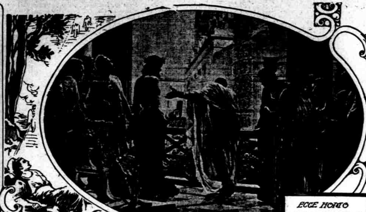
ECCE HOMO BEHOLD THE MAN!

WHOEVER will may now, without money and without price, see and hear the panorama and the story of man's life on earth. He may learn through the medium of his eyes and his ears how "through all the ages one increasing purpose runs."