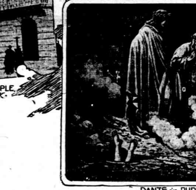
DANTE IN PURGATORY

availing itself of the habits of a modern race as modified by many inventions. It has been said that much study is a weariness to the flesh and of the making of many books tears is no end.