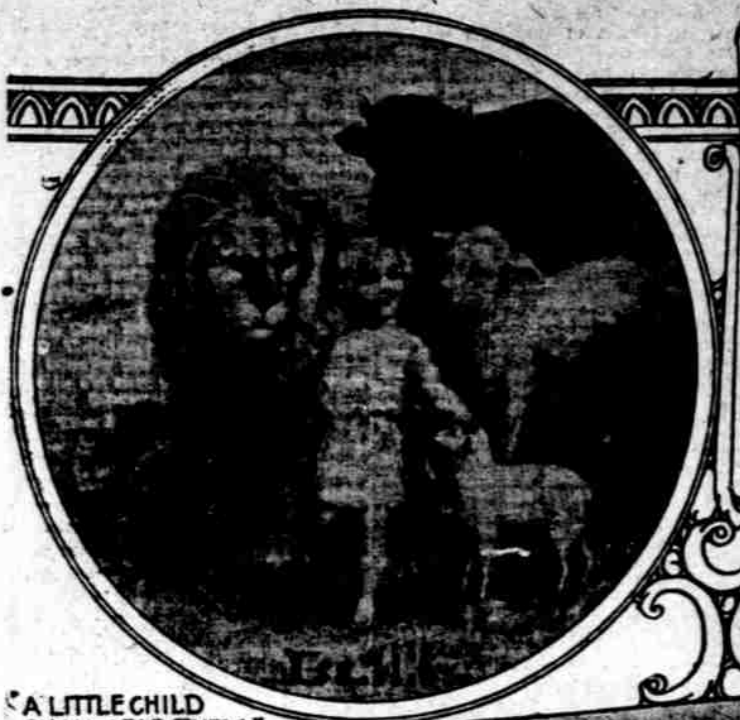
A LITTLE CHILD SHALL LEAD THEM

Photo-Drama Dedicated to People of the World by International Bible Students Association In Effort to Stimulate Interest in God's Word Representation of Saviour's Earthly Career Staged Amid Actual Holy Land Scenes