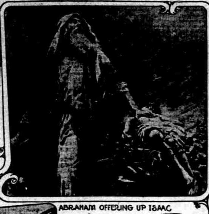
ABRAHAM OFFERING UP ISAAC