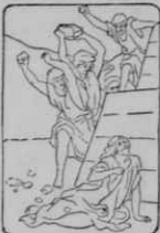
The Wicked Vine-dressers.

Thus God planted a vineyard in the world, the Jewish nation, bound to Him by their Law Covenant. He set a hedge about them—the Divine promise that as long as they were faithful and loyal to God, they would be thoroughly protected against their enemies. Jehovah Himself was their Watchtower. He placed as watchmen the Prophets, who warned the people in respect to every breaking down of the wall; for this protection could be broken down only by disloyalty, carelessness, sin, on Israel's part.