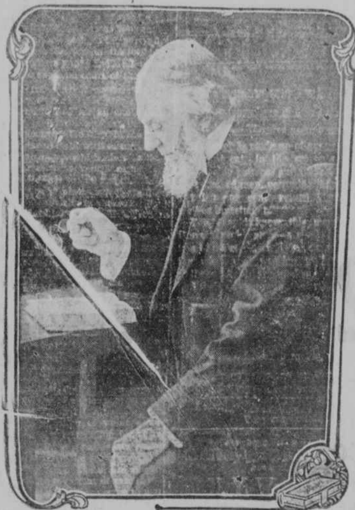
PASTOR RUSSELL IN CHARACTERISTIC ATTITUDE.