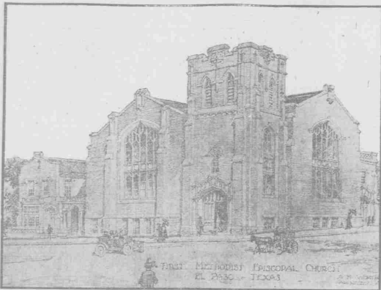
PROPOSED NEW FIRST METHODIST EPISCOPAL CHURCH, CORNER OF MONTANA AND LEE STREETS