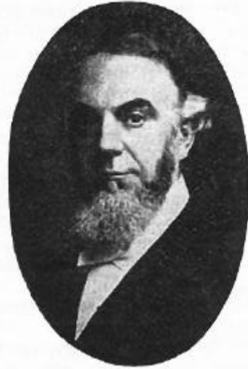
Brother C. T. Russell.

The world considers this work book selling. No other book has been excluded from the bookstores, public press, etc. as much as the Dawn, yet no other book has had such a sale. It is the Lord's doings and marvelous in our eyes. This work is preaching, making known the glad tidings in the most effective manner.